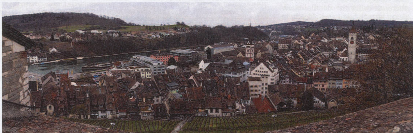
View of the city of Schaffhausen from the Munot

Switzerland. It is mostly productive agricultural land. It lies almost entirely "on the other side" of the river Rhine.