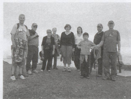
The group that reached the summit

Family Walk - 30 th August at Mount Maunganui - With pouring rain on Sunday morning it did not look like many members would undertake the drive across the Kaimais to join the walk of the Hamilton Swiss Club at Mount Maunganui. Just before 11am, however, the rain stopped and about 25 walkers started the loop track around Mauo. About half of them were keen enough to climb the summit of Mauo via the hidden, steep track about half