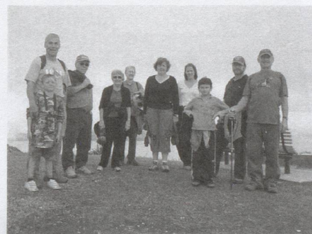
The group that reached the summit

Family Walk - 30 th August at Mount Maunganui - With pouring rain on Sunday morning it did not look like many members would undertake the drive across the Kaimais to join the walk of the Hamilton Swiss Club at Mount Maunganui. Just before 11am, however, the rain stopped and about 25 walkers started the loop track around Mauo. About half of them were keen enough to climb the summit of Mauo via the hidden, steep track about half