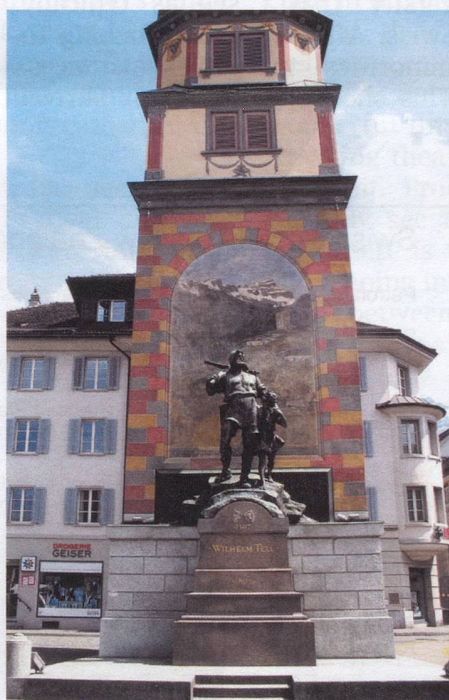
Statue of Wilhelm Tell in Altdorf

tory over the Austrians at Sempach. As a result Uri annexed the lands of Urseren in 1410.