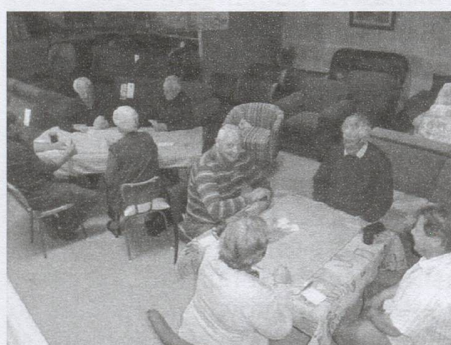
Both teams playing cards

lost. Next was the Shotput which Hamilton won fairly convincingly and because Hamilton had already won the shooting the pressure was on either team to win the Cards but luck wasn't our way and Auckland won this, also