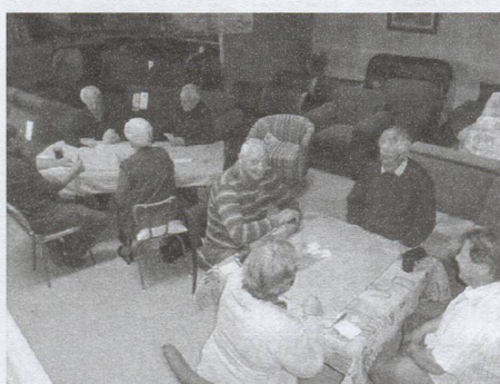
Both teams playing cards

lost. Next was the Shotput which Hamilton won fairly convincingly and because Hamilton had already won the shooting the pressure was on either team to win the Cards but luck wasn't our way and Auckland won this, also