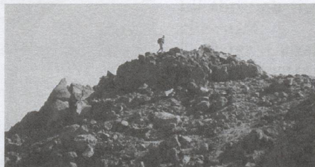
Typically where would you see Vitus but on top of the hill by Meads Wall

old haunt of the Waikato Tramping Club for some, where photos were taken/first lift/meads wall (where Lord of the Rings was filmed) - so different in summer time with no snow around. A weekend enjoyed by all who