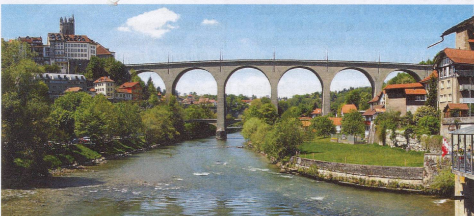
One of Fribourg's many bridges

ble streets, bedecked with wrought-iron lamp standards and ornate inn signs, are picturesque and characterful. Six bridges, from medieval wooden fords to lofty modern valley spans, provide woodcut-pretty views back across the town of the old houses piled up together on the slopes.