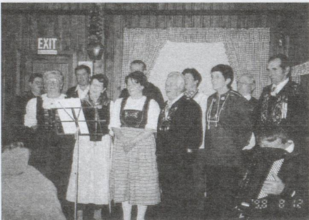
The singing group performing on the 1st August 2008

This year we held the Swiss National Day celebrations on the actual day - 1 st August - with an excellent crowd of approximately 85 adults and children. Many people wore Swiss costumes, which helped create a great atmosphere and made the hall look very colourful. All our sixty 1 st August badges were sold, amid people having a glass of wine or beer with lovely traditional background music. The table decorations were lovely, and brought even more colour to our nice hall. The formalities of the evening commenced, with the speech from the President of the Confederation, Mr Pascal Couchepin, which was short, informative and interesting, fol-