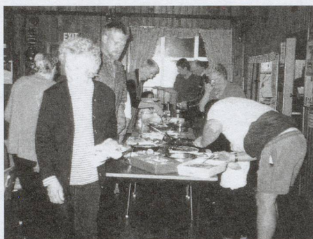
Part of a small crowd that enjoyed a pot-luck tea in June

A Potluck Tea was held following the cards and shooting on the 15 th June. This was a very pleasant event with a delicious tea. Numbers weren't great, but the noise sure made up for the lack of people!!!