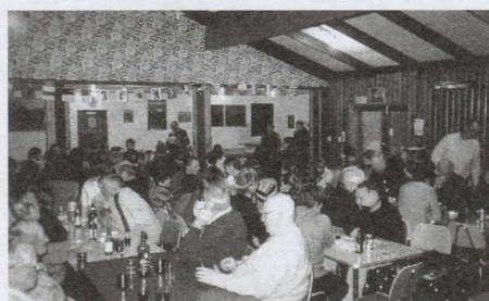
A terrific crowd of over 140 enjoyed the Anniversary shoot