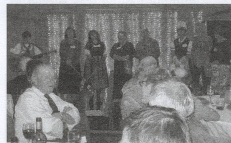
Women singers entertained us all beautifully at the Sorrento wit their potpourri