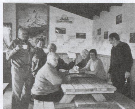
The jassers... the Taranaki lot still smiling after their narrow loss

... but they could just be deceiving us!!! The next morning we left bright and early to ensure that we would be at the farm at Kaupakapaka in time to compete in the final of the Cowbell Competitions ... we had already won the shooting, and the remaining disciplines were shot put, keglen and jassen. The keglen soon got underway, with the jassen not far behind. There were four jassers from each club ... our team was made up of four ladies, while the Aucklanders were a male dominant team ... now, although the scores were even, the Aucklanders won on a points difference ... ladies, our men might well say,