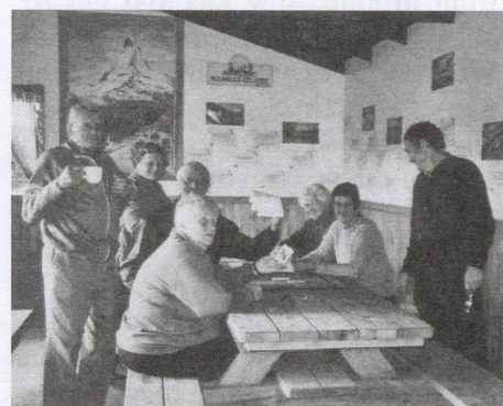
The jassers... the Taranaki lot still smiling after their narrow loss

... but they could just be deceiving us!!! The next morning we left bright and early to ensure that we would be at the farm at Kaupakapaka in time to compete in the final of the Cowbell Competitions ... we had already won the shooting, and the remaining disciplines were shot put, keglen and jassen. The keglen soon got underway, with the jassen not far behind. There were four jassers from each club ... our team was made up of four ladies, while the Aucklanders were a male dominant team ... now, although the scores were even, the Aucklanders won on a points difference ... ladies, our men might well say,