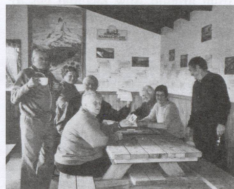
The jassers... the Taranaki lot still smiling after their narrow loss

... but they could just be deceiving us!!! The next morning we left bright and early to ensure that we would be at the farm at Kaupakapaka in time to compete in the final of the Cowbell Competitions ... we had already won the shooting, and the remaining disciplines were shot put, keglen and jassen. The keglen soon got underway, with the jassen not far behind. There were four jassers from each club ... our team was made up of four ladies, while the Aucklanders were a male dominant team ... now, although the scores were even, the Aucklanders won on a points difference ... ladies, our men might well say,