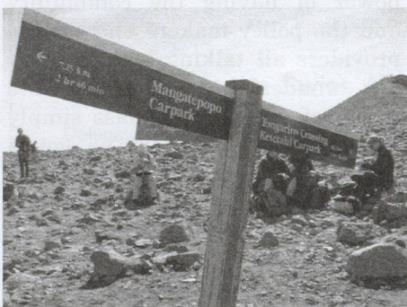
Some of the trampers having a rest during the Tongariro Crossing