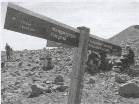
Some of the trampers having a rest during the Tongariro Crossing