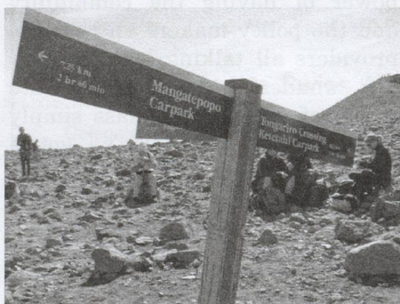
Some of the trampers having a rest during the Tongariro Crossing