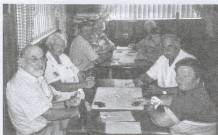
The jassers hard at it!!

On February 9 we hosted the semi-final of the Cowbell Competition against Wellington where we compete in shooting, shot put, keglen and jassen. The Wellingtonians arrived in time for a lunch of barbequed Bratwurst and Vienna sausages, and some liquid refreshments before the stern competition started. We were sad that, due to work commitments, President Ro-