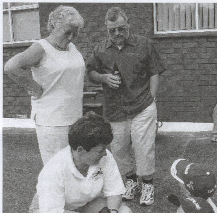
Is there a problem?

A big crowd arrived for the fun and the sausages, drinks and Ice Creams were soon sold. It was hot and sunny in Kaponga while it rained in Eltham. Then we watched the boys competing in the sawdust. Good to see the Wellington boys taking part and winning some rounds too. Well done.