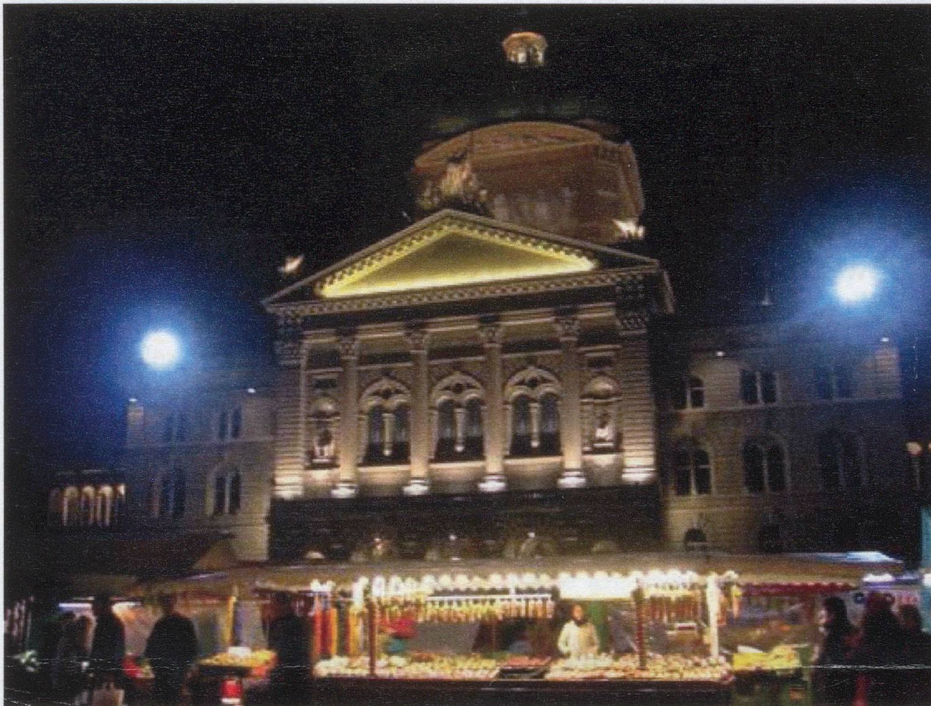
Market stalls in front of the Bundeshaus in Bern