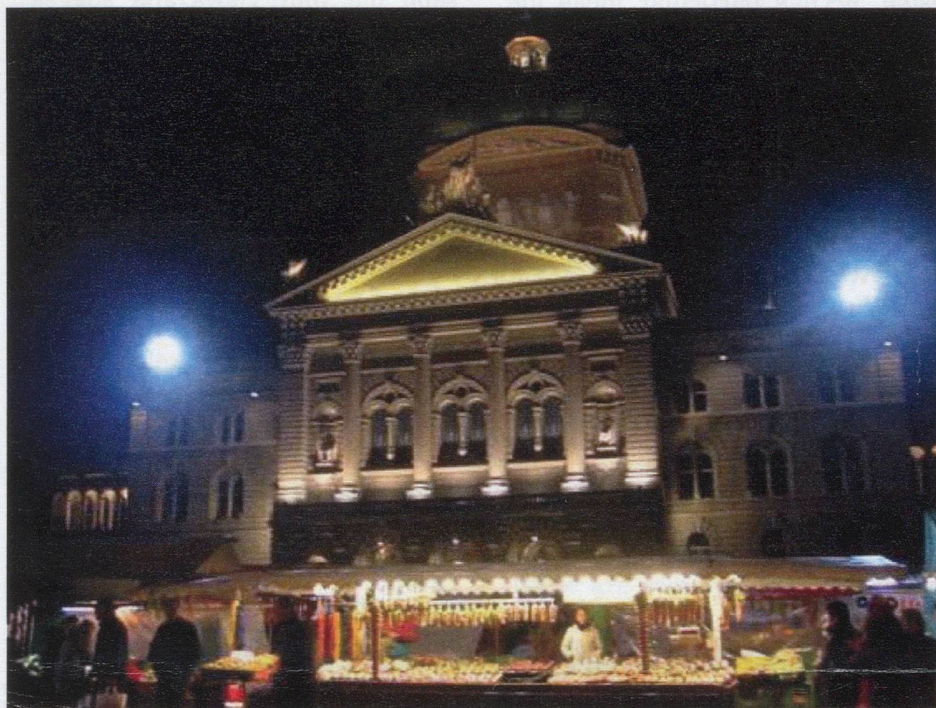
Market stalls in front of the Bundeshaus in Bern