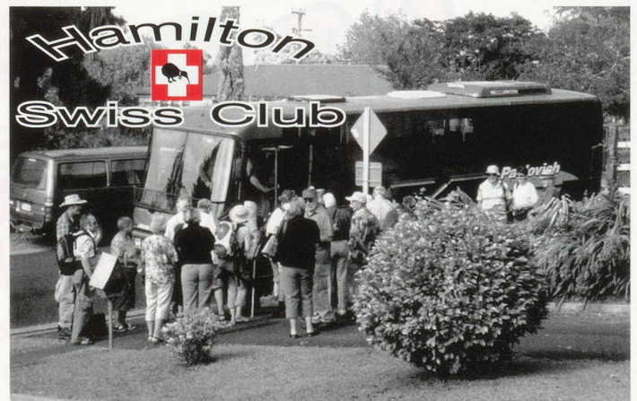
Hamilton Club: Swiss Farmers saying goodbye to their host families.