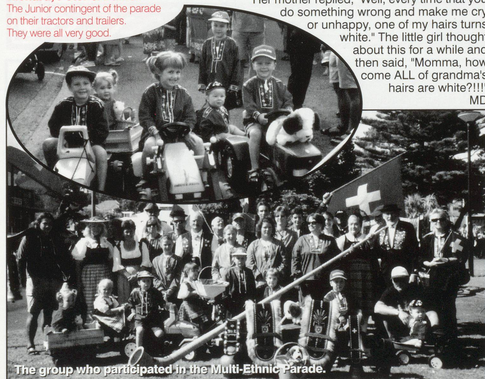
The group who participated in the Multi-Ethnic Parade.