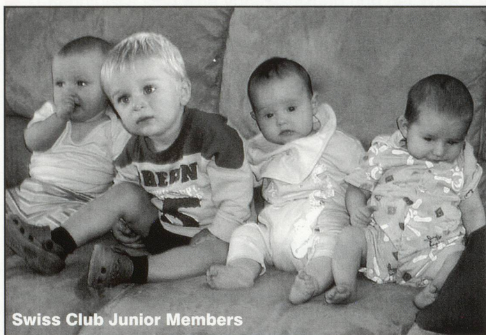
Swiss Club Junior Members