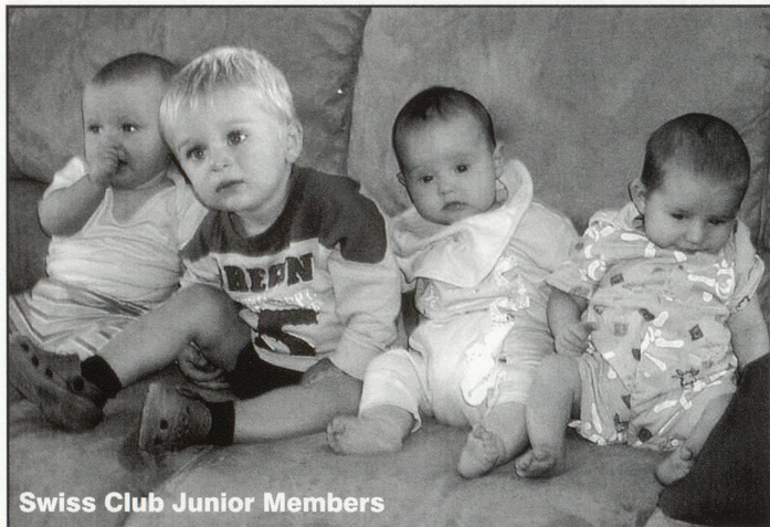
Swiss Club Junior Members