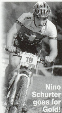
Nino Schurter goes for Gold!

One of the gold medal winners, Nino Schurter (U23 Cross Country) on the climb to the top of mount Ngongotha in Rotorua.