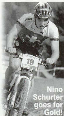
Nino Schurter goes for Gold!

One of the gold medal winners, Nino Schurter (U23 Cross Country) on the climb to the top of mount Ngongotha in Rotorua.