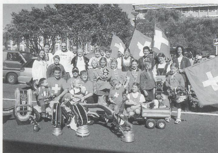
Many of our younger members in Swiss costume ready to walk in the multi-ethnic parade, with the beautiful bells in front, together with several Swiss flags.