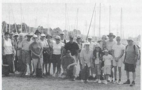
The family walk group photo