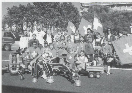
Many of our younger members in Swiss costume ready to walk in the multi-ethnic parade, with the beautiful bells in front, together with several Swiss flags.