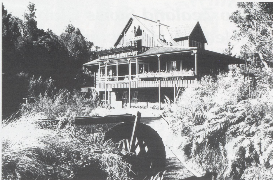
Anderson's Alpine lodge... a beautiful Swiss Log Chalet at the edge of the National Park.