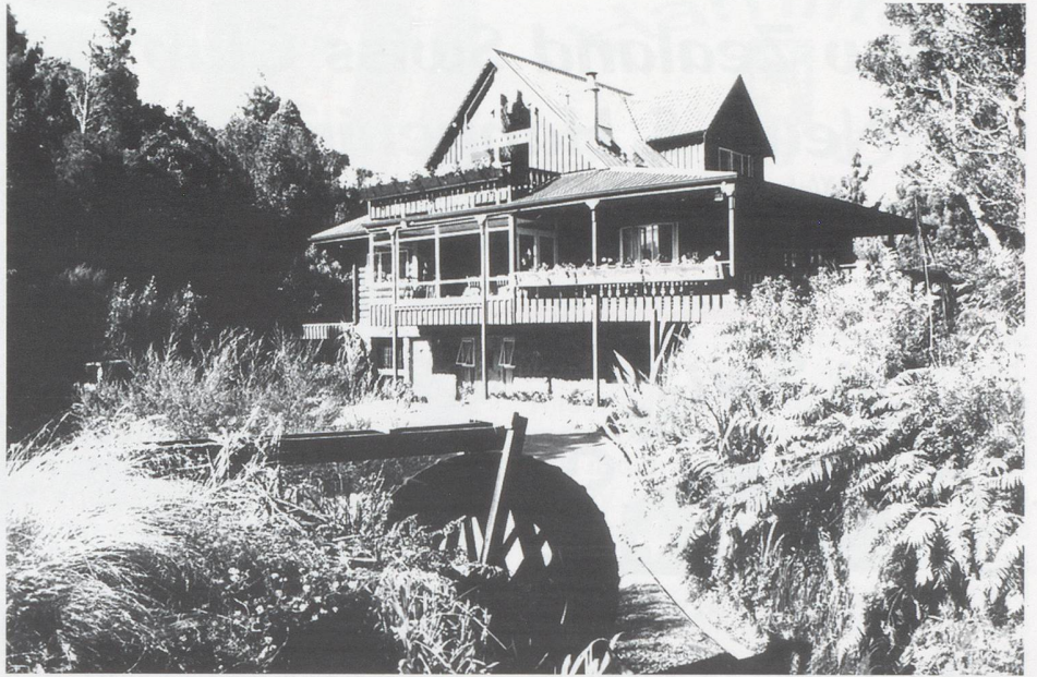
Anderson's Alpine lodge... a beautiful Swiss Log Chalet at the edge of the National Park.