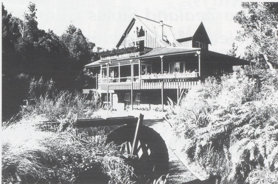
Anderson's Alpine lodge... a beautiful Swiss Log Chalet at the edge of the National Park.