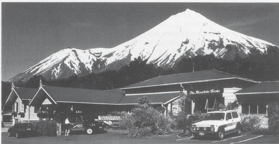
The Mountain House with Mt Egmont/Taranaki behind

The Mountain House has ten rooms. There is an inviting sauna and spa pool