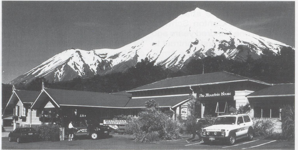
The Mountain House with Mt Egmont/Taranaki behind

The Mountain House has ten rooms. There is an inviting sauna and spa pool