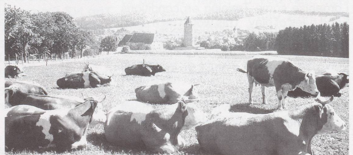
Siesta time with Jura in the background