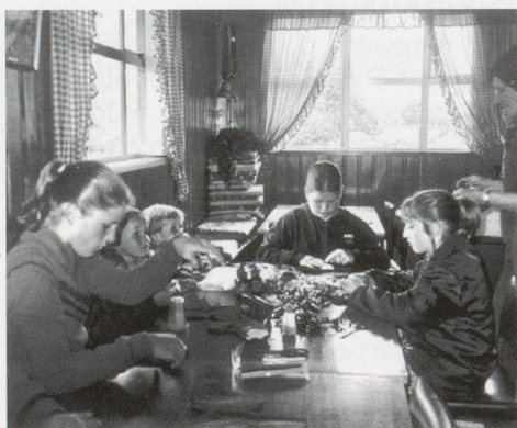
The children busy decorating their stockings.

Many children also took part in the Christmas Shoot ... it was great to see your enthusiastic participation, and we look forward to your continued support in the years to come.