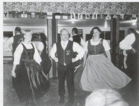
Some of the lovely costumes worn by ETUI members.