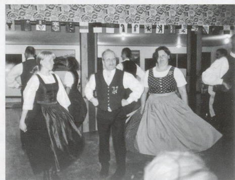
Some of the lovely costumes worn by ETUI members.