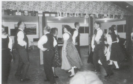
Members of the trachtentanz group in action.

On October 31 we hosted a group from ETUI (European Tanz Union) who boasted members from Germany (the main contingent in the group), Austria and Switzerland. They were touring New Zealand and wanted to perform at different venues, so they showed their talents at the Wellington and Taranaki Swiss Clubs, and were hosted by the Bohemian Society in Auckland and Hamilton. They presented items of dancing (trachtentanz) from various European countries, singing and music. Some of the trachtentanz performed