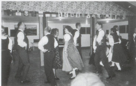
Members of the trachtentanz group in action.

On October 31 we hosted a group from ETUI (European Tanz Union) who boasted members from Germany (the main contingent in the group), Austria and Switzerland. They were touring New Zealand and wanted to perform at different venues, so they showed their talents at the Wellington and Taranaki Swiss Clubs, and were hosted by the Bohemian Society in Auckland and Hamilton. They presented items of dancing (trachtentanz) from various European countries, singing and music. Some of the trachtentanz performed