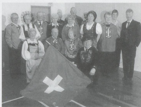
Augustfeier 2003, Eureka.

Christmas Function will take place on Sunday, December 7, 11 am at the Newstead School. Please note new venue as the Tamahere School is undergoing major alterations and additions. Newstead