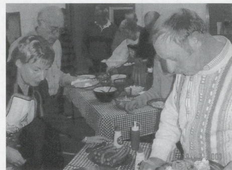
Augustfeier 2003, Eureka.

On August 24 we all met at Ann Street in Hamilton for our walk along the Waikato River. The recently completed entire walkway begins at the Hamilton Gardens in the south, and runs for several kilometres along the riverbank through to the northern suburbs. At 11am, about 25 adults and 10 children, some still in pushchairs, and others on their bikes, headed northwards