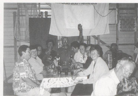
Part of the crowd enjoying the barbeque after the parade.

Kegeln - this enjoyable sport is being played on the first and third Thursday of the month except June to September, December and January. They have been fortunate to see a few new faces attending and have had great fun. Many participants enjoy a game or three of jassen in between the kegeln, and a delicious supper is held thereafter.