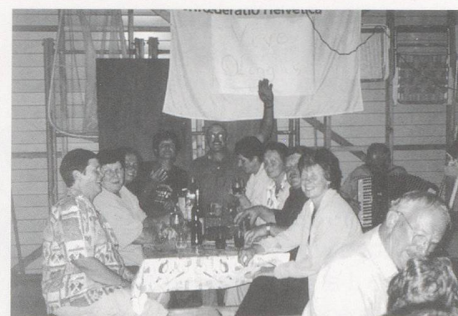
Part of the crowd enjoying the barbeque after the parade.

Kegeln - this enjoyable sport is being played on the first and third Thursday of the month except June to September, December and January. They have been fortunate to see a few new faces attending and have had great fun. Many participants enjoy a game or three of jassen in between the kegeln, and a delicious supper is held thereafter.