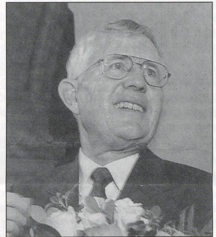
Swiss Federal President for the Year 2002 Finance Minister Kaspar Villiger