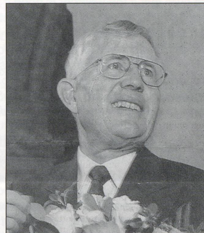
Swiss Federal President for the Year 2002 Finance Minister Kaspar Villiger