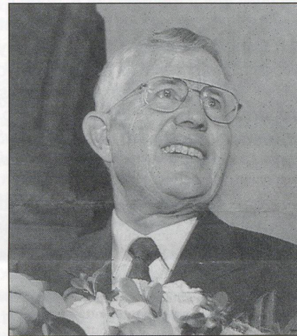
Swiss Federal President for the Year 2002 Finance Minister Kaspar Villiger