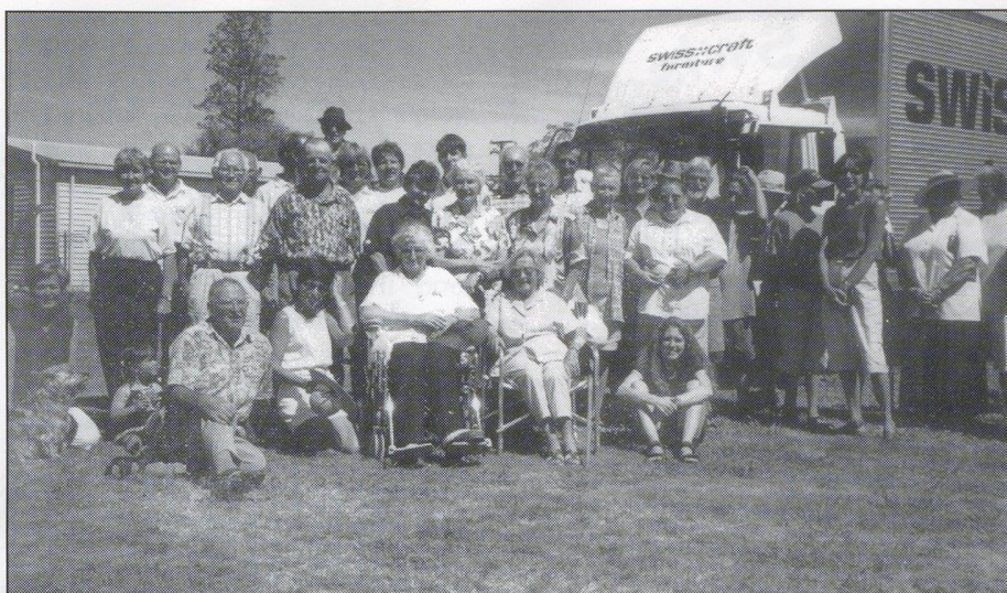
Annual picnic at Eureka; A selection of some prominent Swiss-Kiwis in attendance, including some visitors from Switzerland.

The Hamilton Swiss Club AGM will be held on Saturday, 21st April, at 7.30 pm , at Swisscraft Premises,