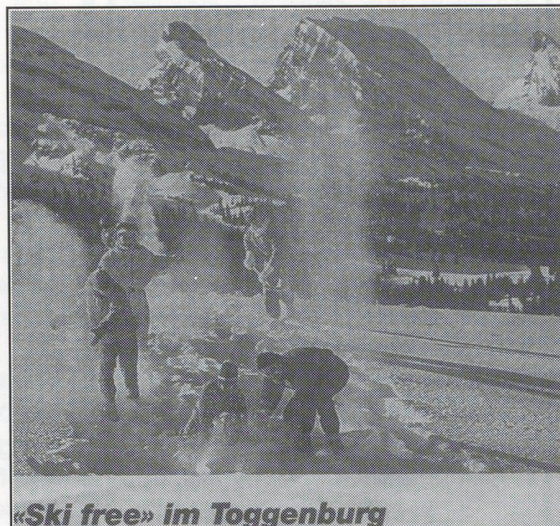
"Ski free" im Toggenburg

An Italian company has allegedly laundered around SFr800 million worth of dirty money through Swiss banks and financial institutions. So far, (18.1.2001) the Italian police have arrested ten people and premises in Switzerland have been searched. Financial institutions in Zurich, Geneva and Lugano are believed to have been involved in the money laundering before the end of 1999. The affair involves an entrepreneur from Naples who ran an import-export company, Italgrani, dealing in cereals.