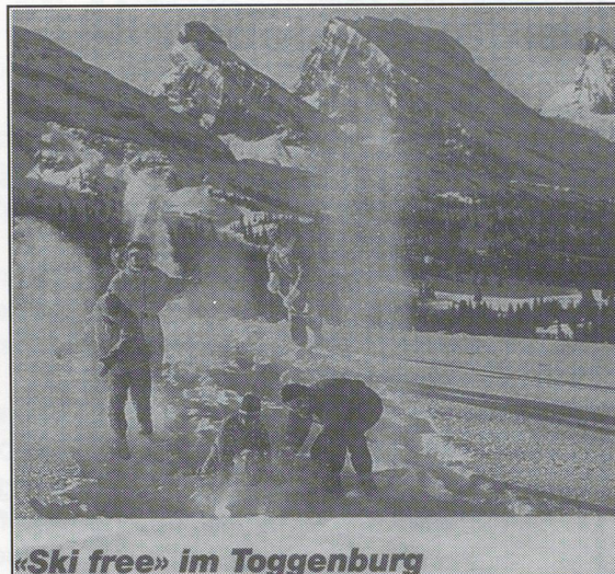
"Ski free" im Toggenburg

An Italian company has allegedly laundered around SFr800 million worth of dirty money through Swiss banks and financial institutions. So far, (18.1.2001) the Italian police have arrested ten people and premises in Switzerland have been searched. Financial institutions in Zurich, Geneva and Lugano are believed to have been involved in the money laundering before the end of 1999. The affair involves an entrepreneur from Naples who ran an import-export company, Italgrani, dealing in cereals.