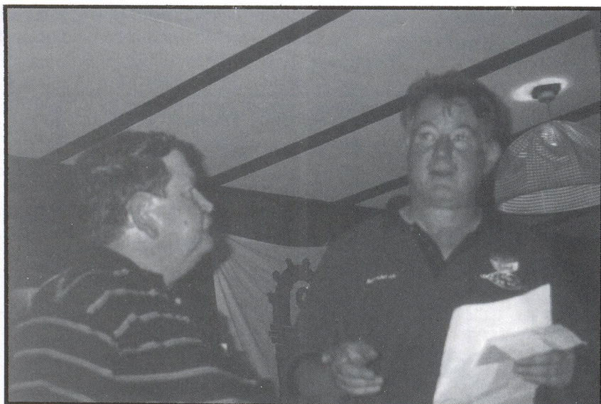
The two presidents; friends rather than opponents.

He was one of thirty-three finalists competing for the honour. Mr Zumthor will receive eighty-eight thousand francs in prize money.