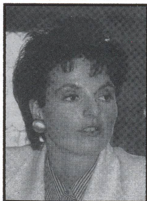
The new Minister of Police and Justice, 34 year old Ruth Metzler , from Canton of Appenzel-Innerrhoden, replacing Arnold Koller.

The election of 2 new Federal Councillors to the Swiss Parliament took place in Berne on 11 March 1999. The resignation of Federal Councillor Arnold Koller and Flavio Cotti both from the CVP-Party made this necessary.