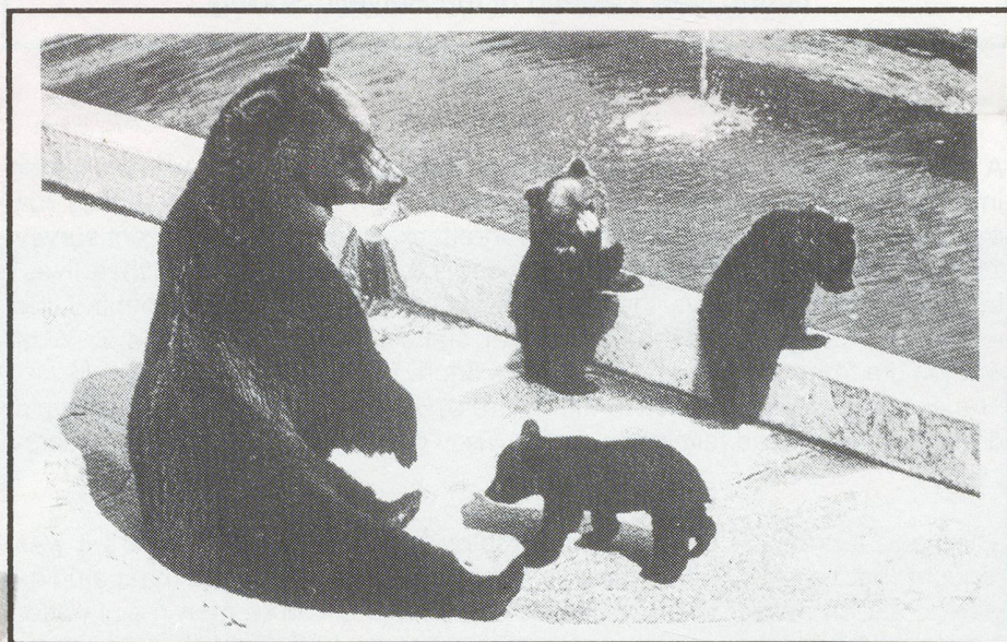
The Bears at play

A so called bicycle-journalist, Simon Joller from Solothurn claims to have built the lightest bike in the world. "Move Cat Cheetah" weighs 5755 grams and is obviously constructed out of lightweight materials such as Carbon-fibre. The different parts have come from all over the world and have cost him Sfr.12,767. Complete, this bike would cost around Sfr.16,000, but it is not available on the market as yet.