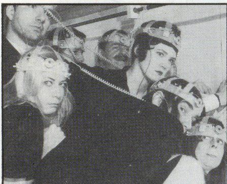
Everyday sounds incorporated into opera.

When a Scotsman was asked what he thought of all the Scottish jokes he answered, "You should use them more sparingly."