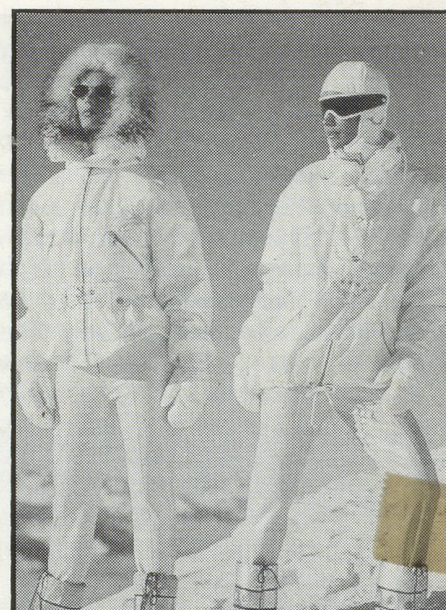
The latest fashion in Ladies ski wear in Switzerland.