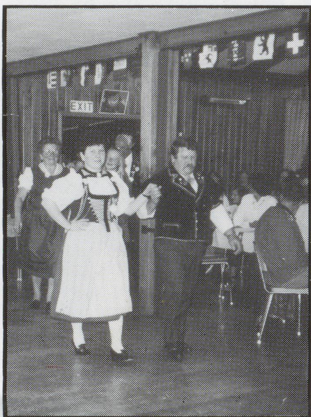
Our folk dancing group about to give a couple of items.