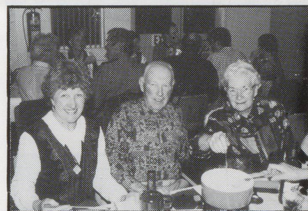
"Fondue isch guät ond git ä guäti Luunä!" Some of our more senior members are having a good time dipping their forks!!