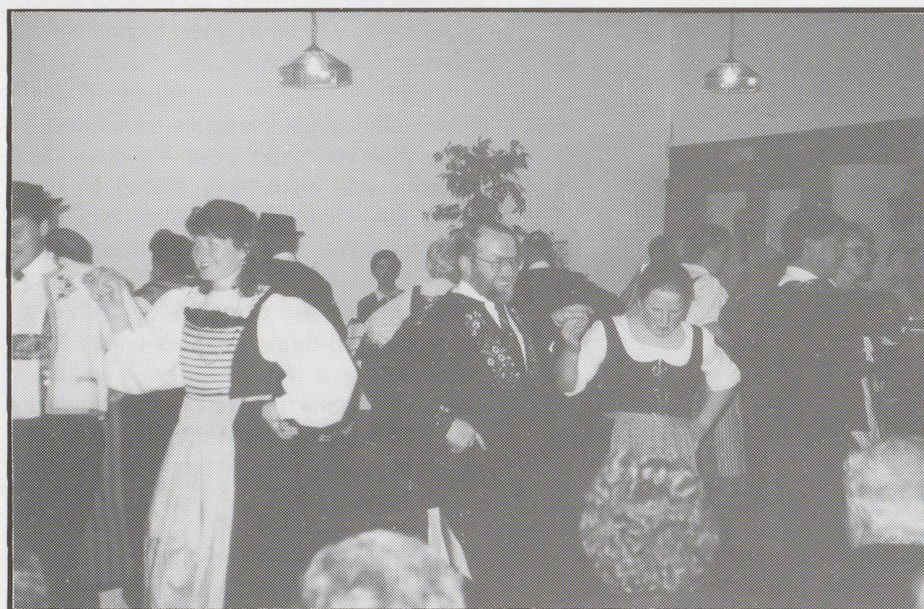
Members of the Hamilton swiss club folk dancing in national costume as part of the entertainment at Society AGM, 1/6/97.