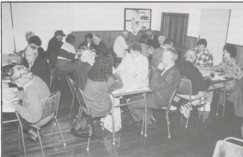
Another successful jass evening of the Hamilton Swiss Club at Eureka. They all want a medal!