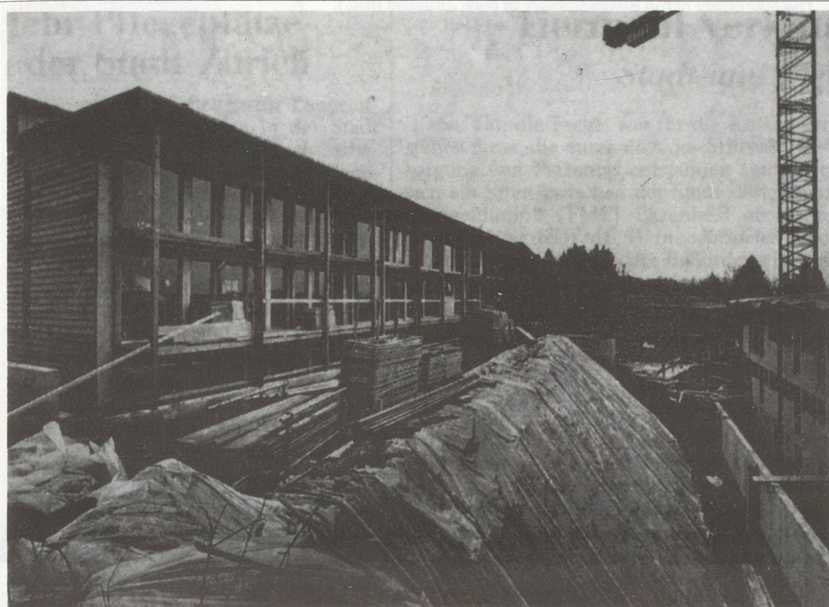
The houses under construction with the main materials being timber and lots of glass.

Apart from the typical Swiss chalets, practically all the housing construction in Switzerland has always been done in concrete or bricks.