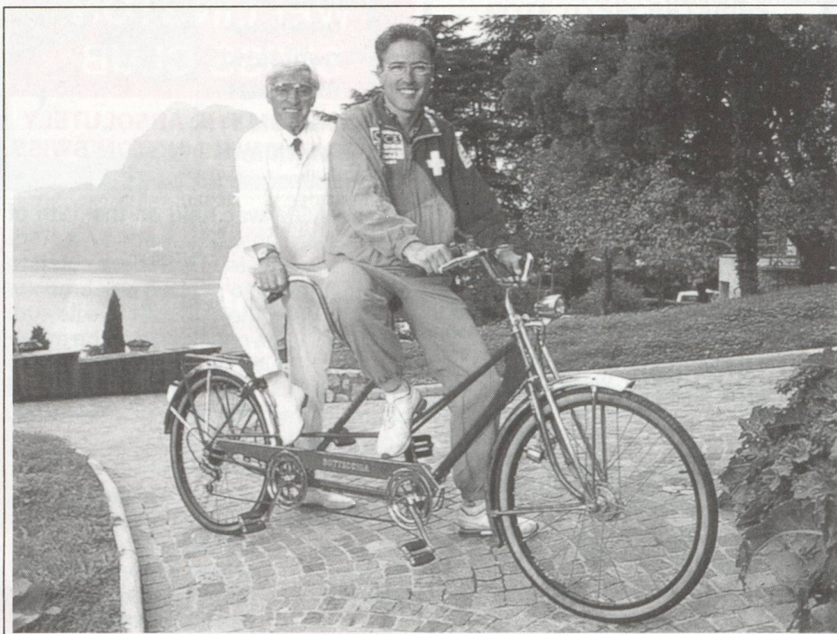
The two World Champions in tandem. Of course Alex Zülle is in front.

When the Swiss Alex Zülle recently became World Champion cyclist in the time trial, the first to congratulate him on his success was no other than Ferdy Kübler who had won the same trophy some 45 years ago in Varese, Italy.