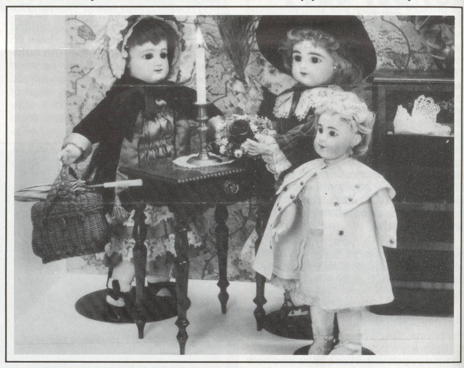
Part of the artful display of dolls in Stein am Rhein's unique dolls museum.