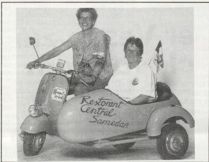
And here is the only Vespa in Switzerland with a side-car. As the picture shows, it comes from Samedan and the owners often hire it out to honeymoon couples!!!