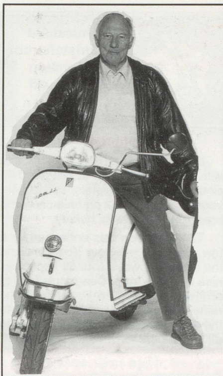
This gentleman is 70 years old and has been riding his Vespa for the past 35 years.