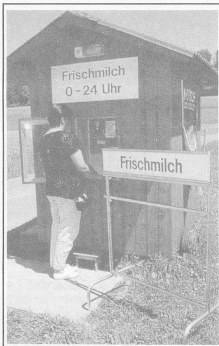
The Milk-Chalet in Oberwil-Lieli where fresh milk is available 24 hours a day seven days a week.

In order to satisfy stringent health regulations, the milk is kept at a strict temperature of 4 degrees centigrades at all times and it is replenished at least twice a day.