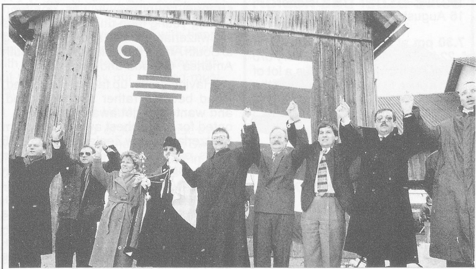
The local Mayor of Vellerat together with members of the Jura Government during the celebrations in front of a huge Jura flag.