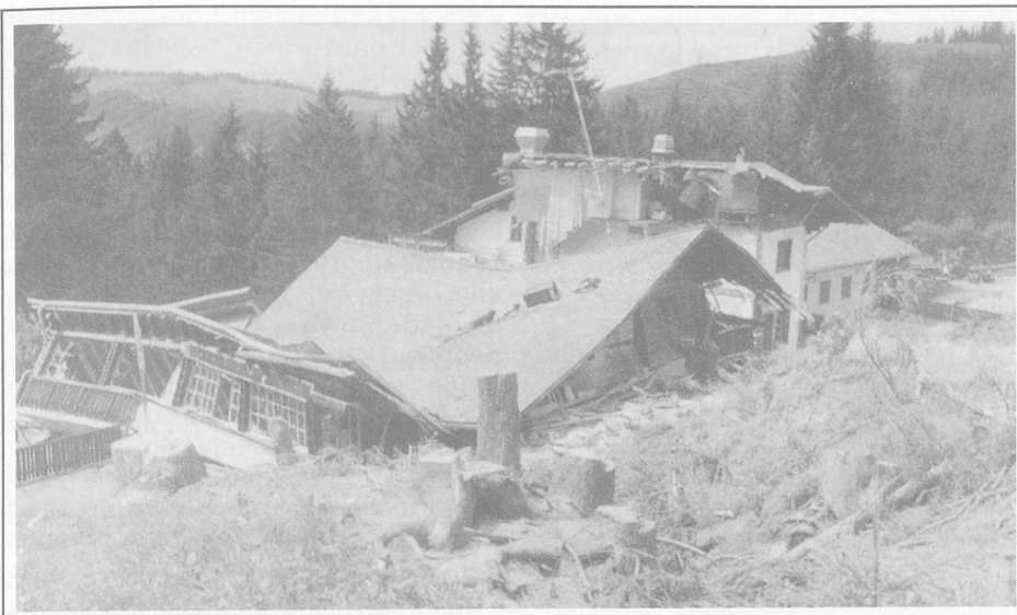
The ruins of the Berghotel as it looks today, a sorry sight indeed.