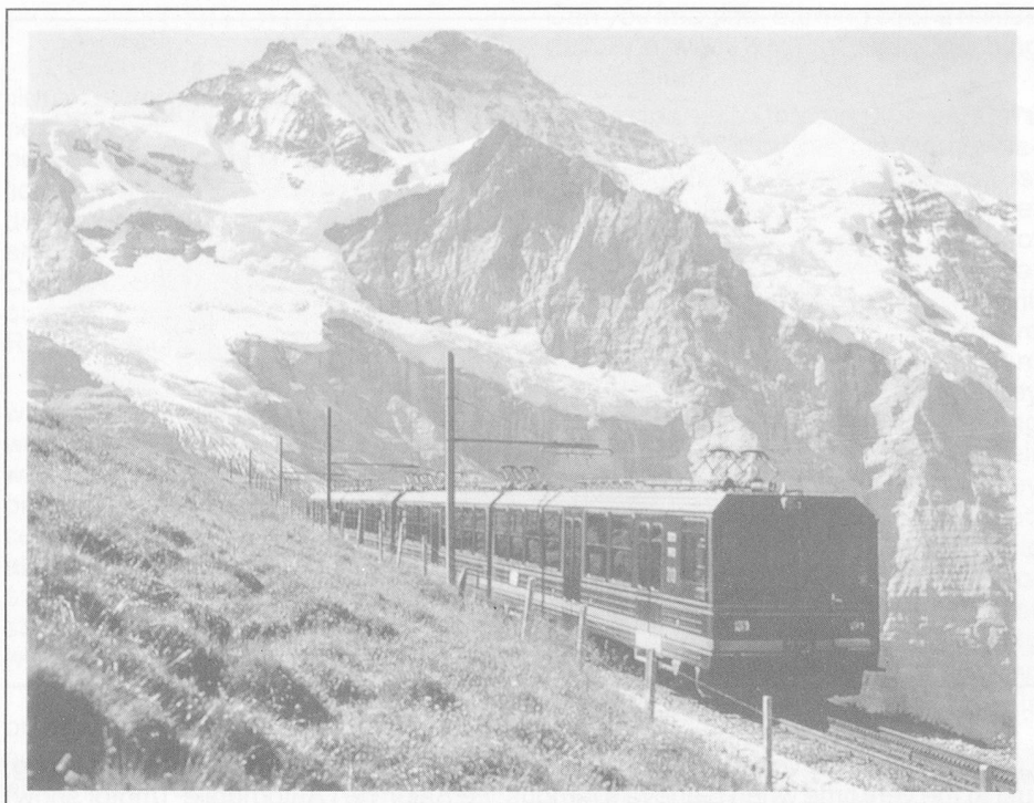
The scenic Jungfrau region symbolises the attraction of Switzerland as a dream destination.

Visitors to Switzerland like the product - but not the price.