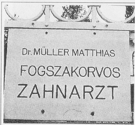
A familiar looking name for a "Hungarian" dentist. Whatever his nationality, his services are much cheaper than in Switzerland.