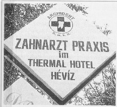
At the thermal hotel "Heviz" even the teeth can take a cure.

To go on holiday to have your teeth attended to is certainly a new kind of tourism and the Hungarians are making the most of it. Realising that having your teeth fixed in a nice place rather than in a drab city is far more pleasant for the patients, Hungarian dentists were quick to open up dozens of new dental clinics and practices in the most sought-after Hungarian spa and holiday resorts. And to better attract their foreign clients, the shields are also written in German as the pictures show.