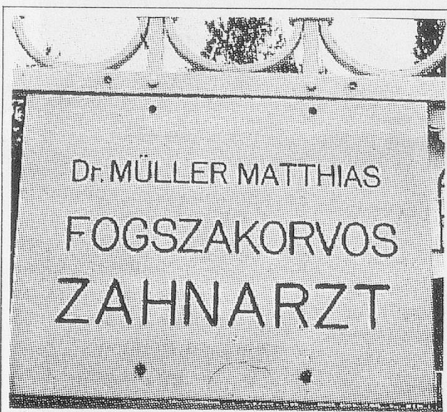
A familiar looking name for a "Hungarian" dentist. Whatever his nationality, his services are much cheaper than in Switzerland.