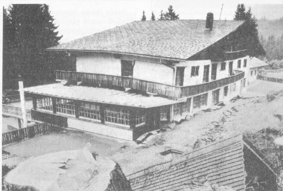
The "Berghotel" in July 1994, already slightly damaged by the moving mass.