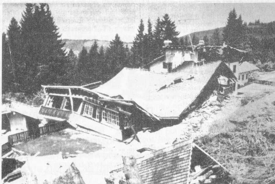
Same place 24 hours later.

some time ago, the slope on which the village was built started to move. In May 1994 some chalets had already sunk by several centimetres. Over 400,000 SFR were spent to stabilise the slope but to no avail. From then on, it was all downhill. Above the village the slope started to move by 70-80 centimetres a day and in the village itself by 10-15 centimetres. Over 10 million cubic-metres or some 25 million tons of earth were estimated to be in motion. Last June the village had to be evacuated.