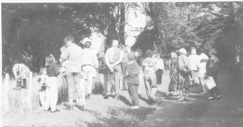
The Bicultural Day participants on the site of the famous pa called Mataitaua. The St Albans Church in the background was consecrated in 1898.