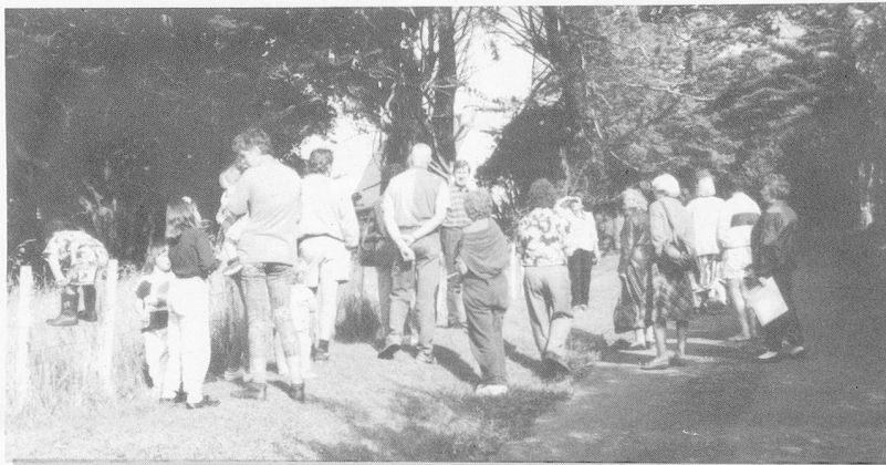
The Bicultural Day participants on the site of the famous pa called Mataitaua. The St Albans Church in the background was consecrated in 1898.