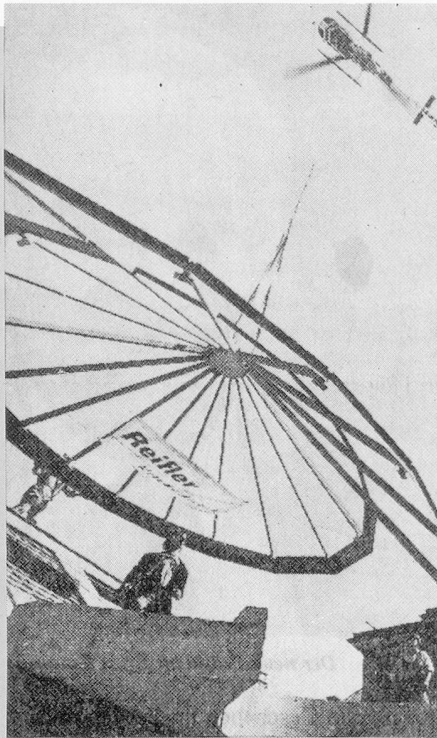
In a spectacular move, a glass dome was placed by helicopter on the top of the building housing Orell Füssli's mammoth book store.

Orell Füssli has just opened Switzerland's biggest book store in Zurich. It offers 2000 square meters of shopping space, with over 100,000 book titles. Eighty staff are ready to look after an expected 5000 customers a day. Mammoth book stores are becoming very fashionable and Zurich is merely following the worldwide trend.