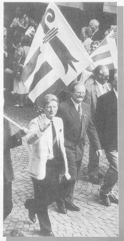
Roland Béguelin (centre) marching in one of the many demonstrations that took place for years in the Jura.

In order to make counterfeiting more difficult, new five franc coins may be produced in 2 or even 3 colours. This was announced recently by the Federal Councillor Otto Stich (now Bundespräsident) when he opened the new Federal Mint in Berne. To obtain multicoloured coins, different metal amalgams are being used, one for the central part of the coin and one or two others as outer ring or rings.