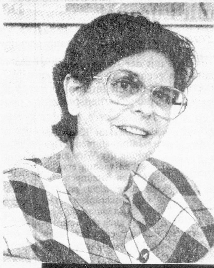
Ruth Dreifuss, the new Federal Councillor.