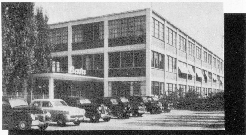
The Bata factory in Möhlin as it existed in 1960. Today, sadly, the manufacturing of shoes at this plant is at a standstill.

Switzerland's best known shoes have actually a foreign origin. Thomas BATA, born in 1876, was a Czech. He was not only the first to produce shoes by machines, but he also built next to his factories whole housing estates for his workers, complete with gardens, parks and shops. One of these typical housing estates still exists in Möhlin (Aargau).