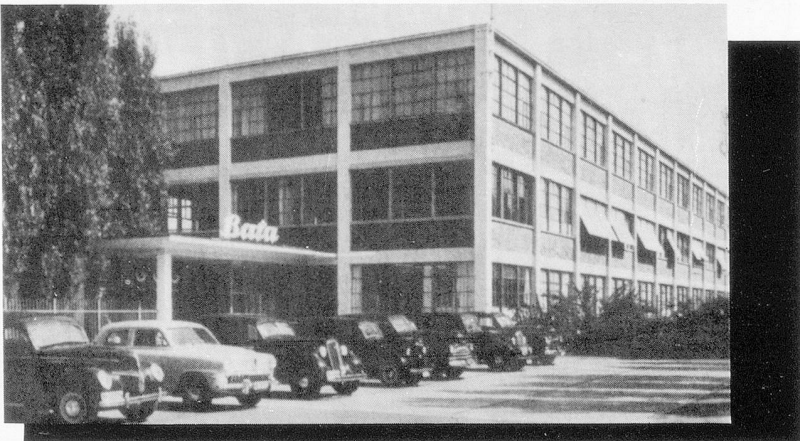
The Bata factory in Möhlin as it existed in 1960. Today, sadly, the manufacturing of shoes at this plant is at a standstill.

Switzerland's best known shoes have actually a foreign origin. Thomas BATA, born in 1876, was a Czech. He was not only the first to produce shoes by machines, but he also built next to his factories whole housing estates for his workers, complete with gardens, parks and shops. One of these typical housing estates still exists in Möhlin (Aargau).