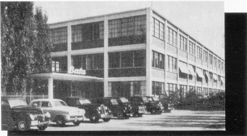
The Bata factory in Möhlin as it existed in 1960. Today, sadly, the manufacturing of shoes at this plant is at a standstill.

Switzerland's best known shoes have actually a foreign origin. Thomas BATA, born in 1876, was a Czech. He was not only the first to produce shoes by machines, but he also built next to his factories whole housing estates for his workers, complete with gardens, parks and shops. One of these typical housing estates still exists in Möhlin (Aargau).