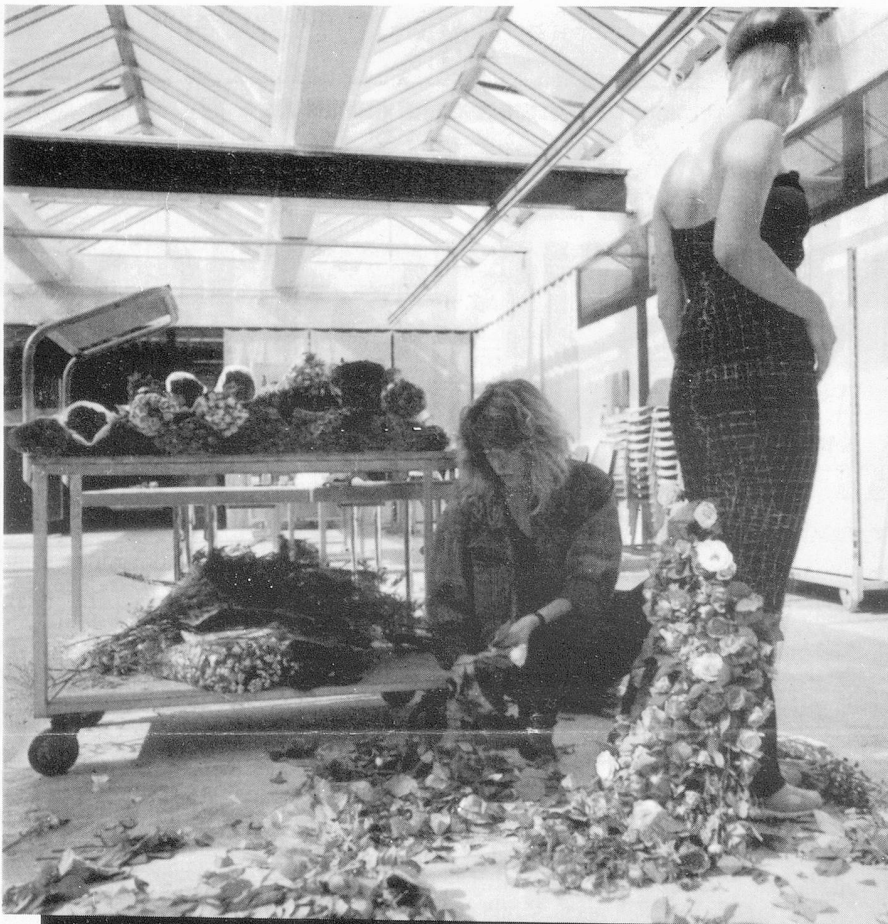
Hours of prickly work. Hundreds of flowering roses are stitched into the train of this evening gown.